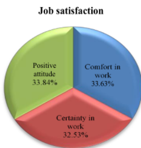
Figure 3. Job satisfaction indicator percentage

Positive attitude is observed to be the highest predictor of civil servant teacher job satisfaction with percentage 33.84%. Such attitude is categorized into intrinsic satisfaction in reference to theory 8 of Herzberg [34] as this attitude is derived from the employees' perception of their work itself. The finding is in accordance with a study reported by Arokiasamy [35] contending that internal factor influences employee job satisfaction. Employee recognition, promotion possibility, and fairness are claimed to give significant impact on job satisfaction. Raza et al.'s research [36] revealed intrinsic factor significant and positive effect on job satisfaction. They used job security, achievement, job responsibility and work itself as the measurement. Using different intrinsic facets to measure job satisfaction, Suhartono [37] explicitly recognized that intrinsic factors do affect job satisfaction. He listed commitment and work professionalism as the two determining factors.